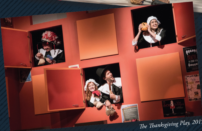
The Thanksgiving Play, 2019