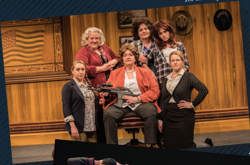
The Secretary, 2020