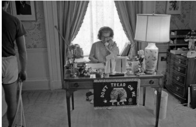
Betty Ford lobbying for the Equal Rights Amendment from her personal desk in the White House

Immediately after moving in, Betty Ford situated herself as a unique White House occupant. Betty was outspoken and unafraid to be herself, declaring "Okay, I'll move to the White House, do the best I can, and if they don't like it, they can kick me out, but they can't make me somebody I'm not." Even more unusual than her self-proclaimed independence, Betty Ford often disagreed with her husband's political positions, despite being a Republican herself. Read more HERE .