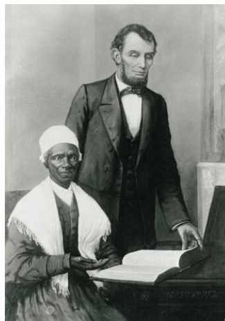
Sojourner Truth and Abraham Lincoln