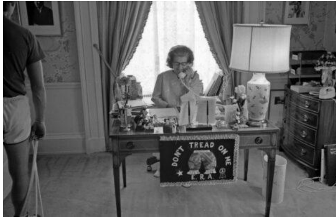
Betty Ford lobbying for the Equal Rights Amendment from her personal desk in the White House

Immediately after moving in, Betty Ford situated herself as a unique White House occupant. Betty was outspoken and unafraid to be herself, declaring "Okay, I'll move to the White House, do the best I can, and if they don't like it, they can kick me out, but they can't make me somebody I'm not." Even more unusual than her self-proclaimed independence, Betty Ford often disagreed with her husband's political positions, despite being a Republican herself. Read more HERE.