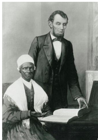
Sojourner Truth and Abraham Lincoln