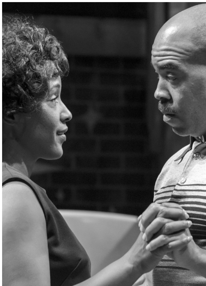
Detroit '67, 2018

We are Curious. And we hope you are too.