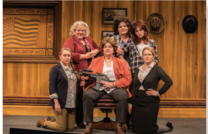
The Secretary, 2020

Now in our third decade of bringing thought-provoking theatre to Denver, Curious Theatre Company’s rich history showcases our commitment to playwrights with gutsy things to say.