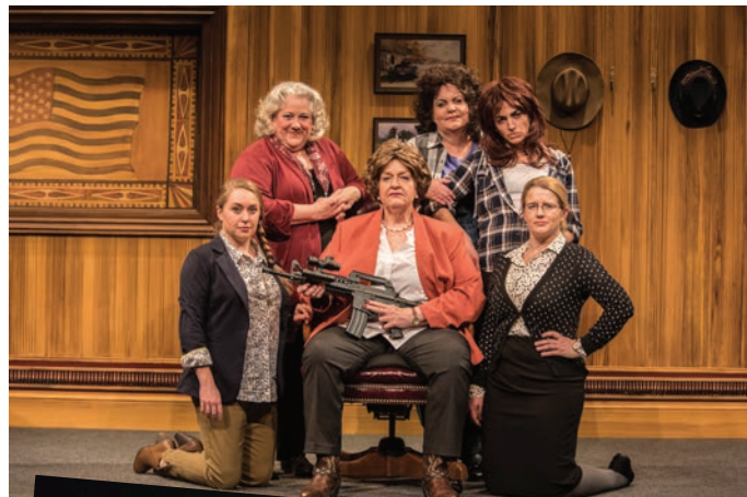
The Secretary, 2020

Now in our third decade of bringing thought-provoking theatre to Denver, Curious Theatre Company’s rich history showcases our commitment to playwrights with gutsy things to say.