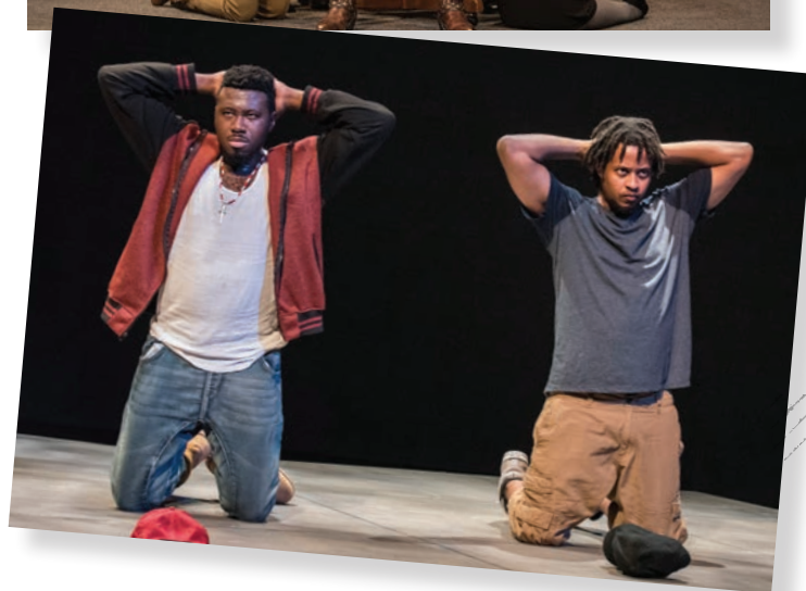
Pass Over, 2019